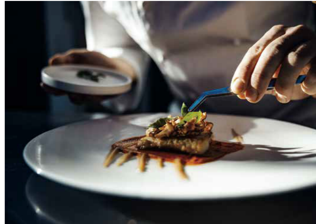
CATERING & PRIVATE CHEF'S TABLE SERVICES From Pan Pacific Hotel, Indigo Hotel, Novotel Hotel