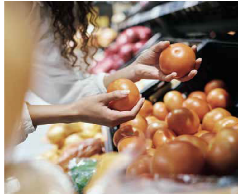
GROCERY SHOPPING & DELIVERY SERVICES From Nirvana Porch to Residences