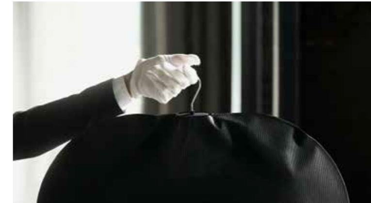
LAUNDRY SERVICES From Nirvana Porch to Residences