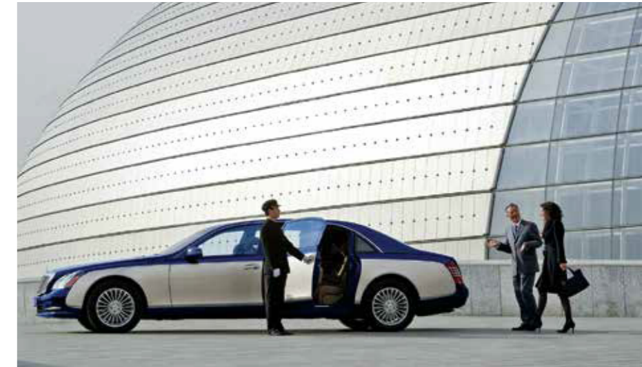
LIMOUSINE TRANSPORTATION SERVICES To Airport & Your Destination