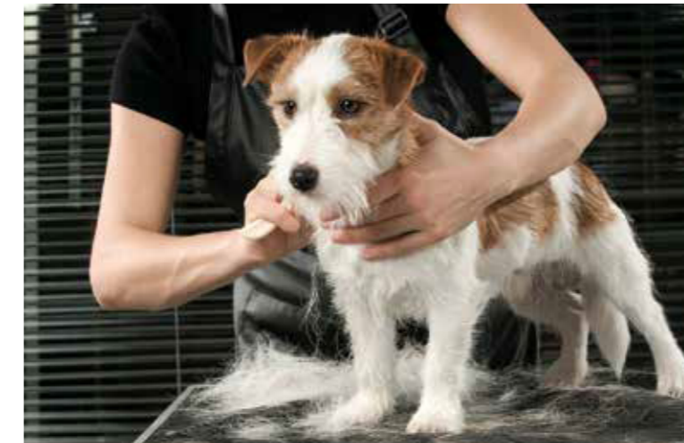
PET CARE SERVICES From Nirvana Porch to Residences