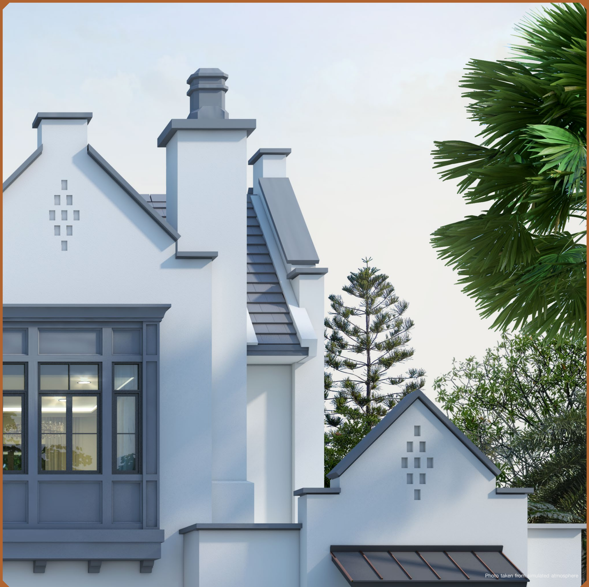
Photo taken from simulated atmosphere