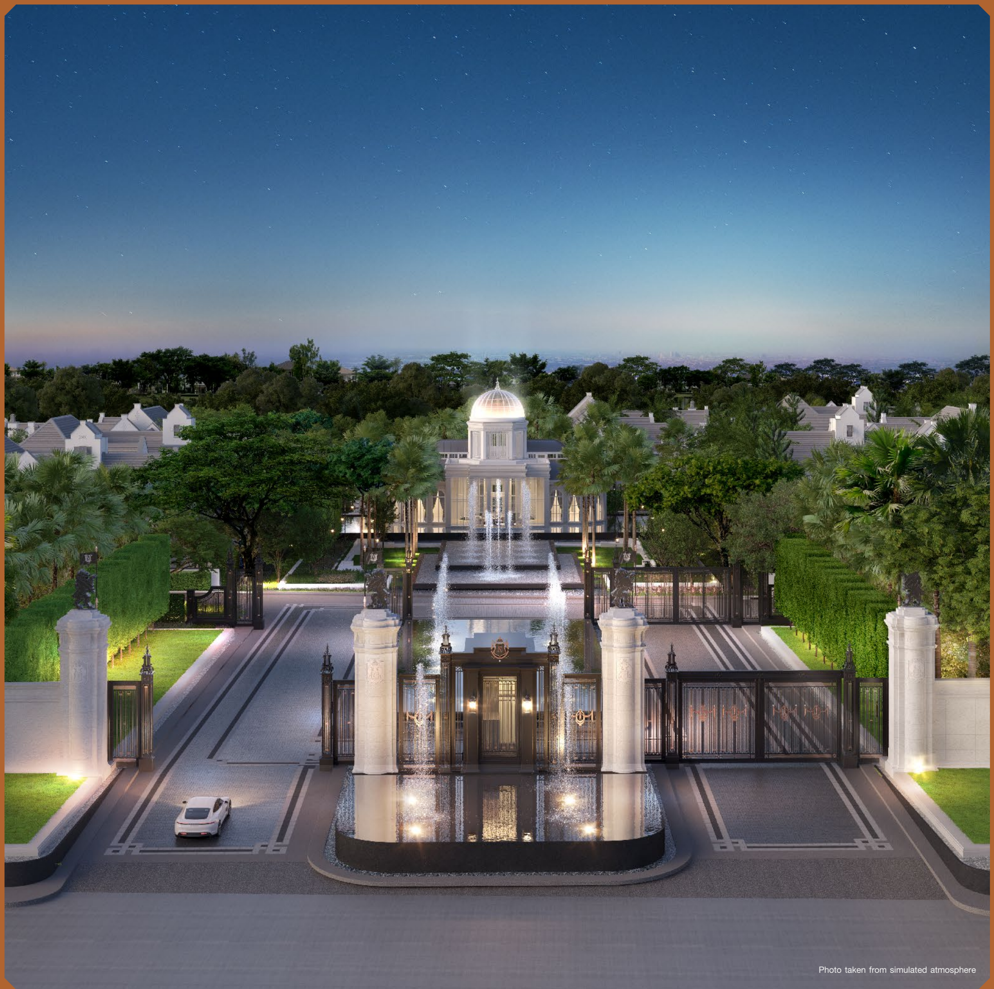
Photo taken from simulated atmosphere