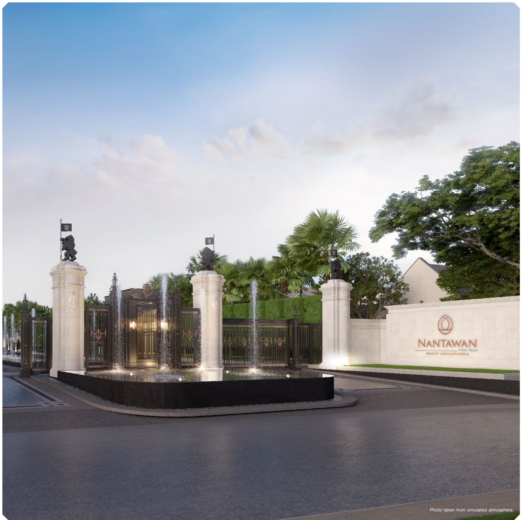
Photo taken from simulated atmosphere