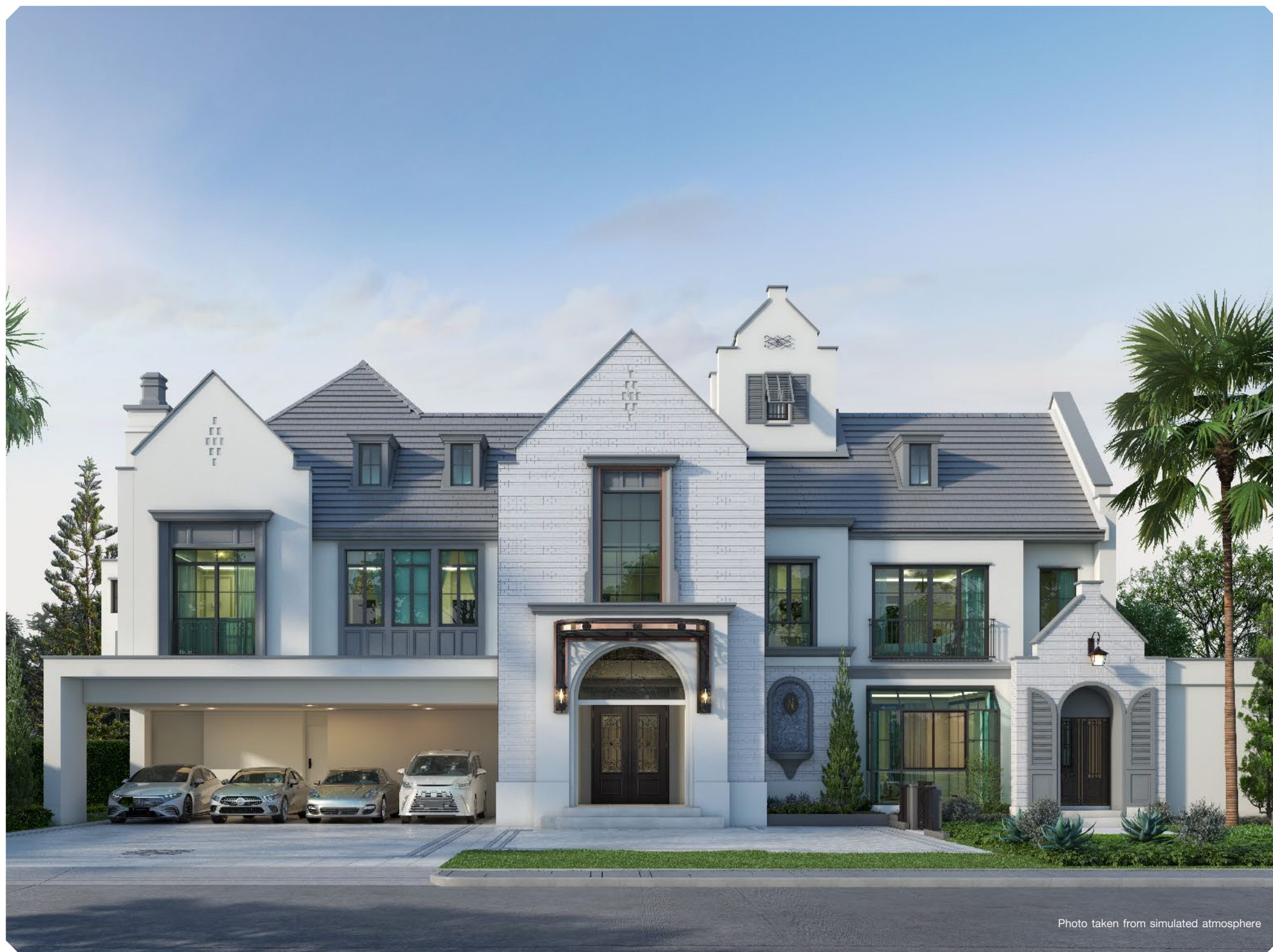
Photo taken from simulated atmosphere

5 Bedrooms | 7 Bathrooms | 2 Living Rooms | 1 Prayer Room | 1 Pool | 2 Maid Rooms | 4-Car Parking