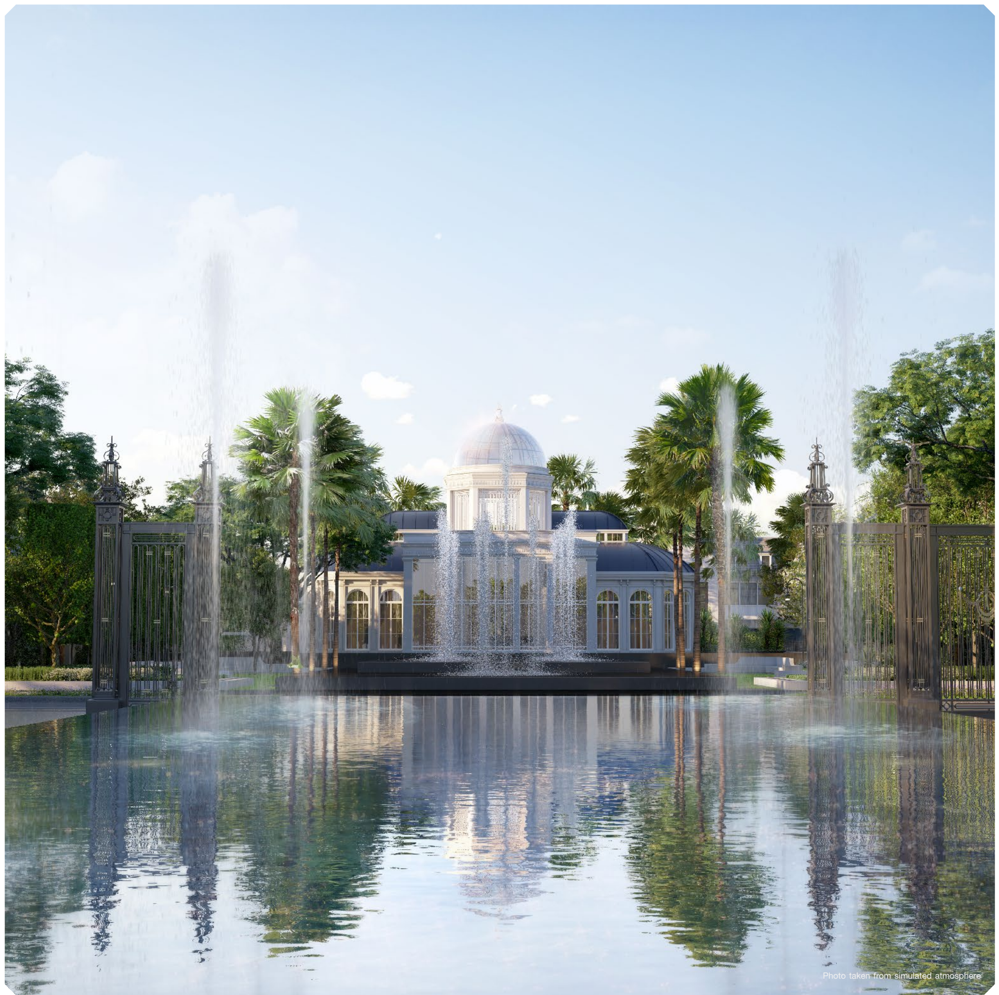
Photo taken from simulated atmosphere