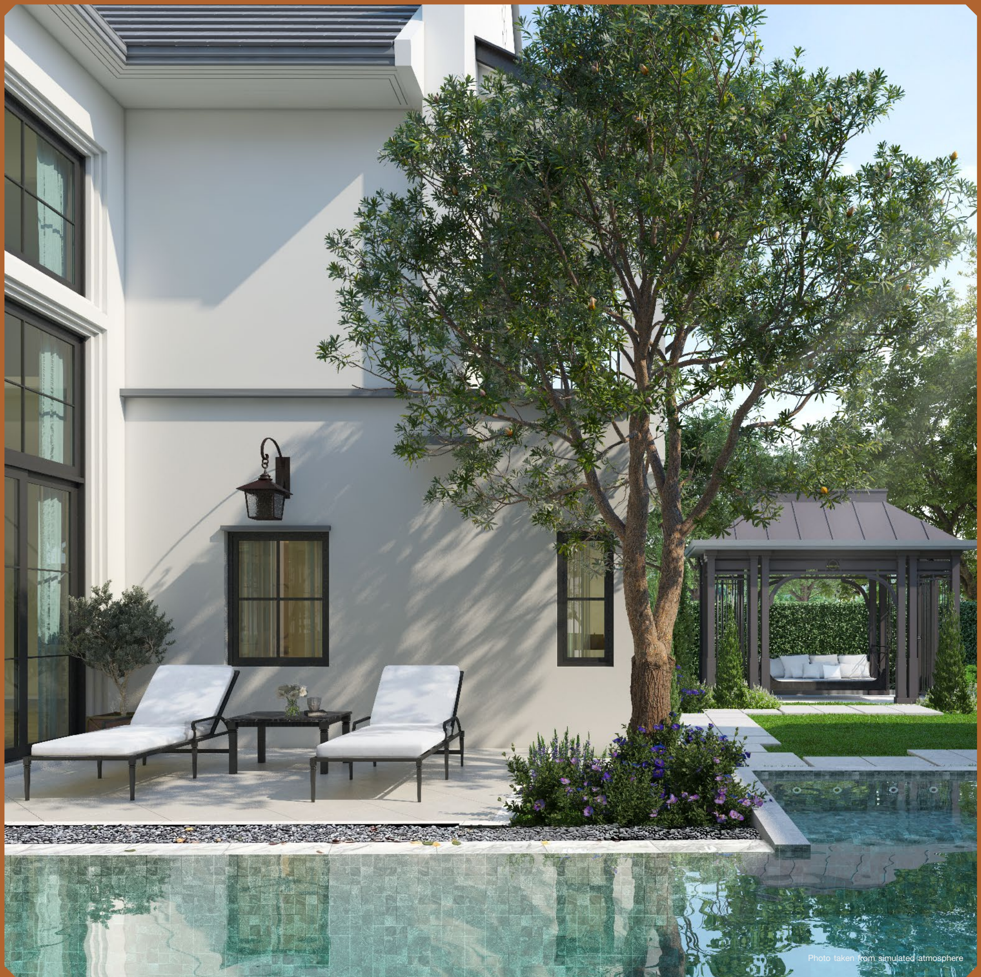
Photo taken from simulated atmosphere